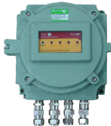
Ex - Proof